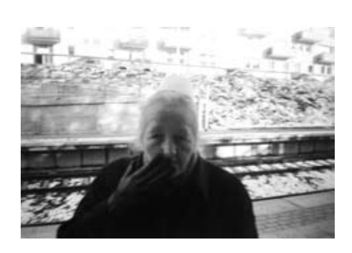
2 Oct - 14 Nov

Running alongside events in Brighton & Hove, Brighton Photo Fringe Hastings is running a series of sixteen shows from established venues such as: Lucy Bell Fine Art Photography, the Hastings Arts Forum gallery, F-ish, the Memorial Gallery, Stonesquid, Electric Palace Cinema, as well as shop windows and local bus stops.